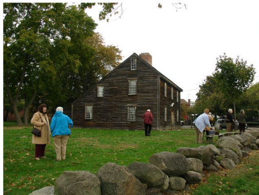
The fall trip to the Adams' Family Homestead was a big success.