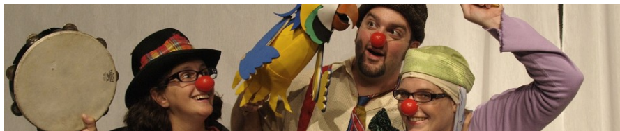
The Nutshell Playhouse performers will delight children in April.